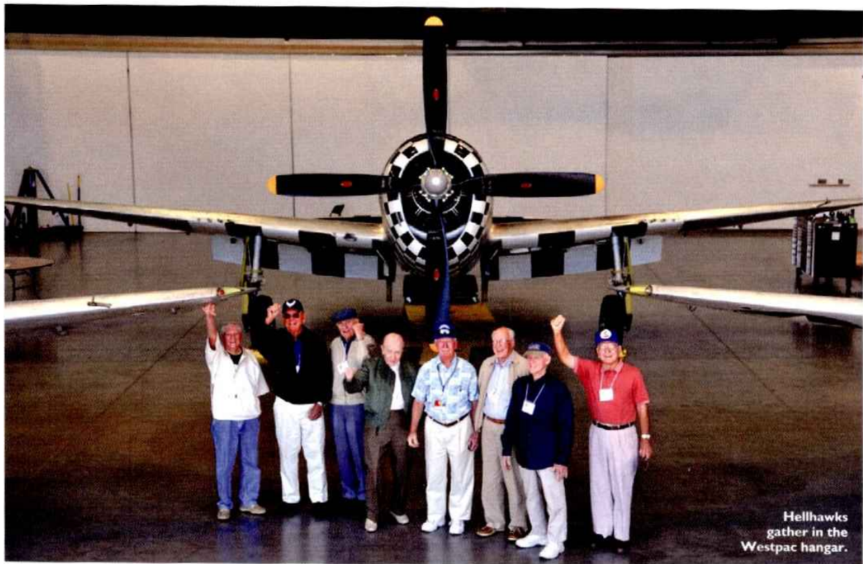
Hellhawks gather in the Westpac hangar.